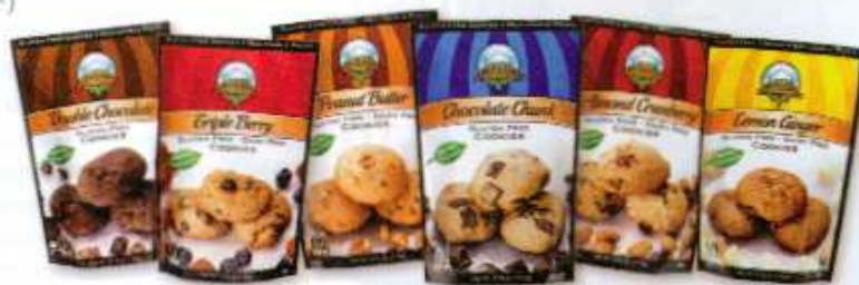
diet & nutrition

other natural/health food stores nationwide. Or purchase through their website, www.aricofoods.com .